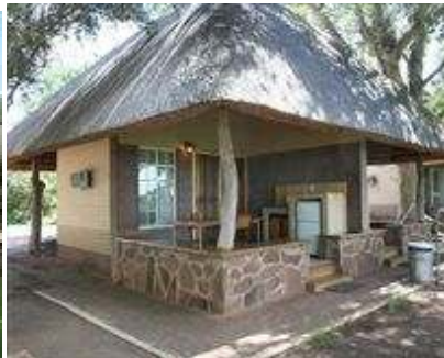
Chalet at Lower Sabie camp.