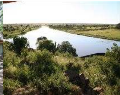
River view from the deck in Camp.