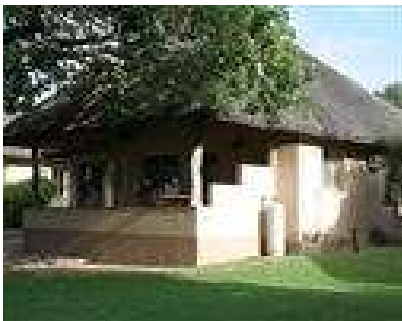
Chalet at Skukuza camp.